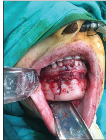
Fracture line before fixation.